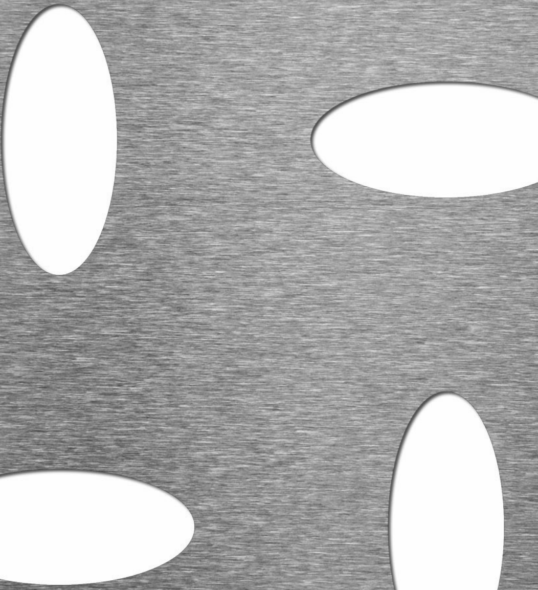
Ellipse EVH 30x70